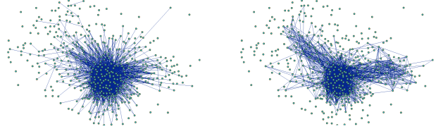
Fig. 3. Drawings of samples obtained with the complete (left) and tbf-complete (right) strategies after the 20 000 link queries. The position of the nodes is the same in the two drawings (it is obtained by a classical graph drawing algorithm ran on the actual network), which makes it possible to observe visually that the links discovered by each strategy are not the same.

Until now, we focused on our ability to discover many links with as few link queries as possible. However, different strategies discover different links, which may have consequences on the properties of the obtained samples: they may be biased by the measurement strategy, and biased differently depending on the strategy we use. This can be observed visually in Figure 3 for instance, and confirmed by the statistics given in Table II.